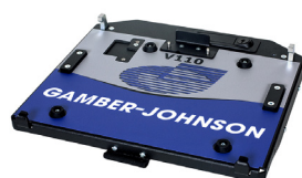
Gamber Johnson Vehicle Dock